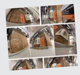
Salford University - Energy House

London School of Fashion's 'Fashion Education in Prisons' project was an excellent example of education reaching out and creating a meaningful and effective partnership. It was achieved in often difficult and trying circumstances and was a win-win activity for all involved. Whilst small scale, the judges felt that the programme was effective in broadening the horizons of staff, students and the often-neglected female prisoners themselves.