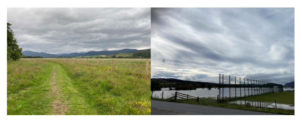
Figure 10: A managed floodplain in Kingussie, Highland before (left) and after (right) flooding. Creating areas of long grass with mown paths allows for improved biodiversity and health and wellbeing benefits during dry periods. During heavy rainfall, floodwater has a place to drain to, avoiding key buildings.