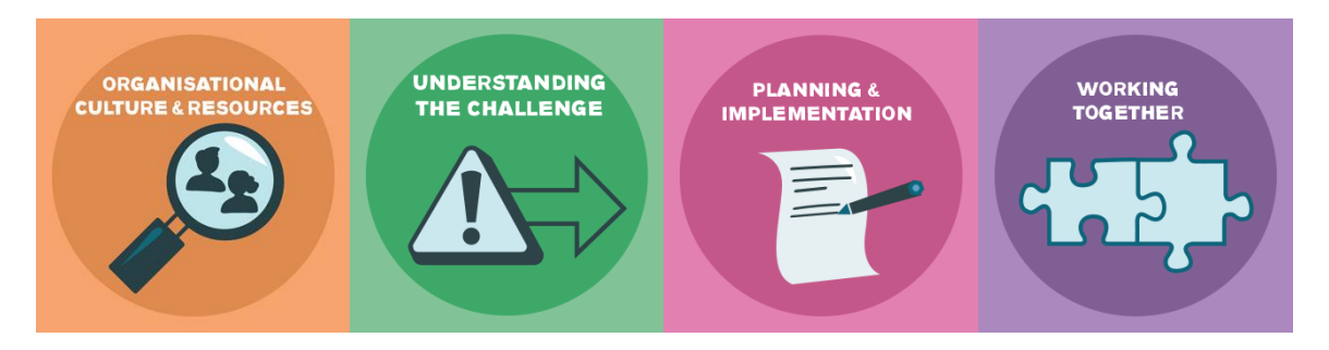
Figure 4: The Four Key Capabilities needed for an organisation's adaptation journey. The Capability Framework describes a number of tasks to develop these capabilities over four stages from starting to mature.