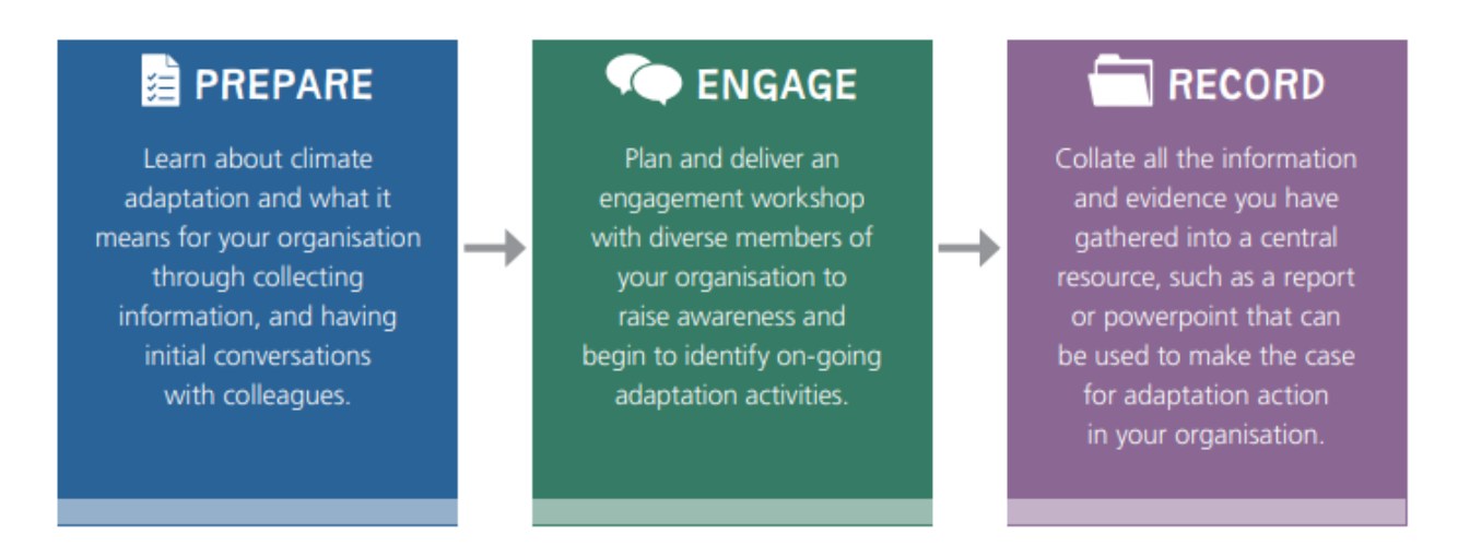
Figure 3: The three main stages in Adaptation Scotland's Starter Pack.