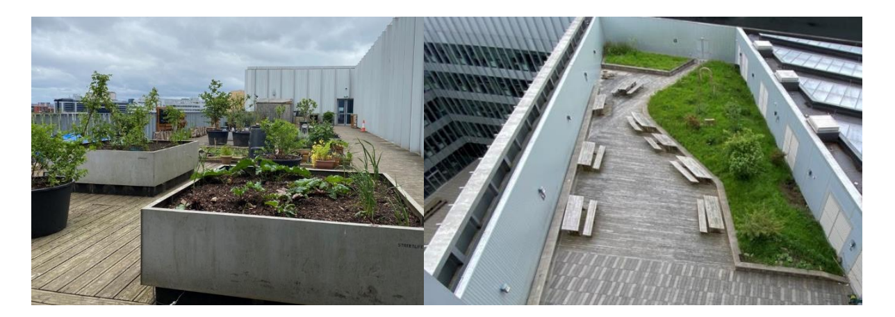
Figure 11: Creating areas of urban green space like this community garden (left) and roof terrace garden (right) on tall buildings have many benefits. They allow for increased health and wellbeing of staff and students and create learning opportunities in food growing and biodiversity. They also act to reduce flooding during heavy rainfall events and cool roof spaces during hot weather spells. Both images are of City of Glasgow College, 2023..

Together we can make Scotland's education institutions resilient to climate impacts and help them flourish for centuries to come.