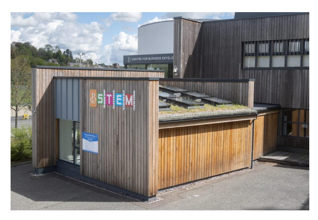
Figure 9: The Borders College STEM Hub Eco Room, based in Hawick, utilises a Passive House approach to ensure high-energy efficiency, making the best use of new materials, super insulation, triple glazing, solar gain and a green roof.