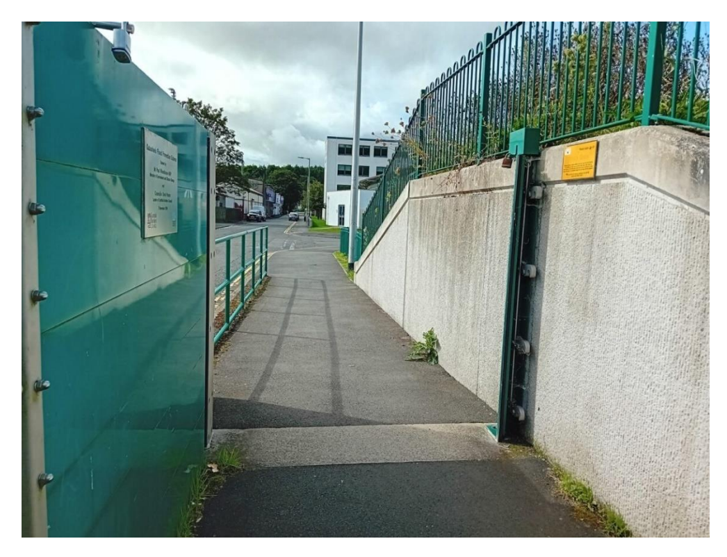
Figure 6: Borders College, Galashiels, flood defense gate.

If you have any further questions on how to conduct a climate risk assessment, please email the Adaptation Scotland programme <u>adaptationscotland@sniffer.org.uk</u> or EAUC Scotland at Scotland@eauc.org.uk.