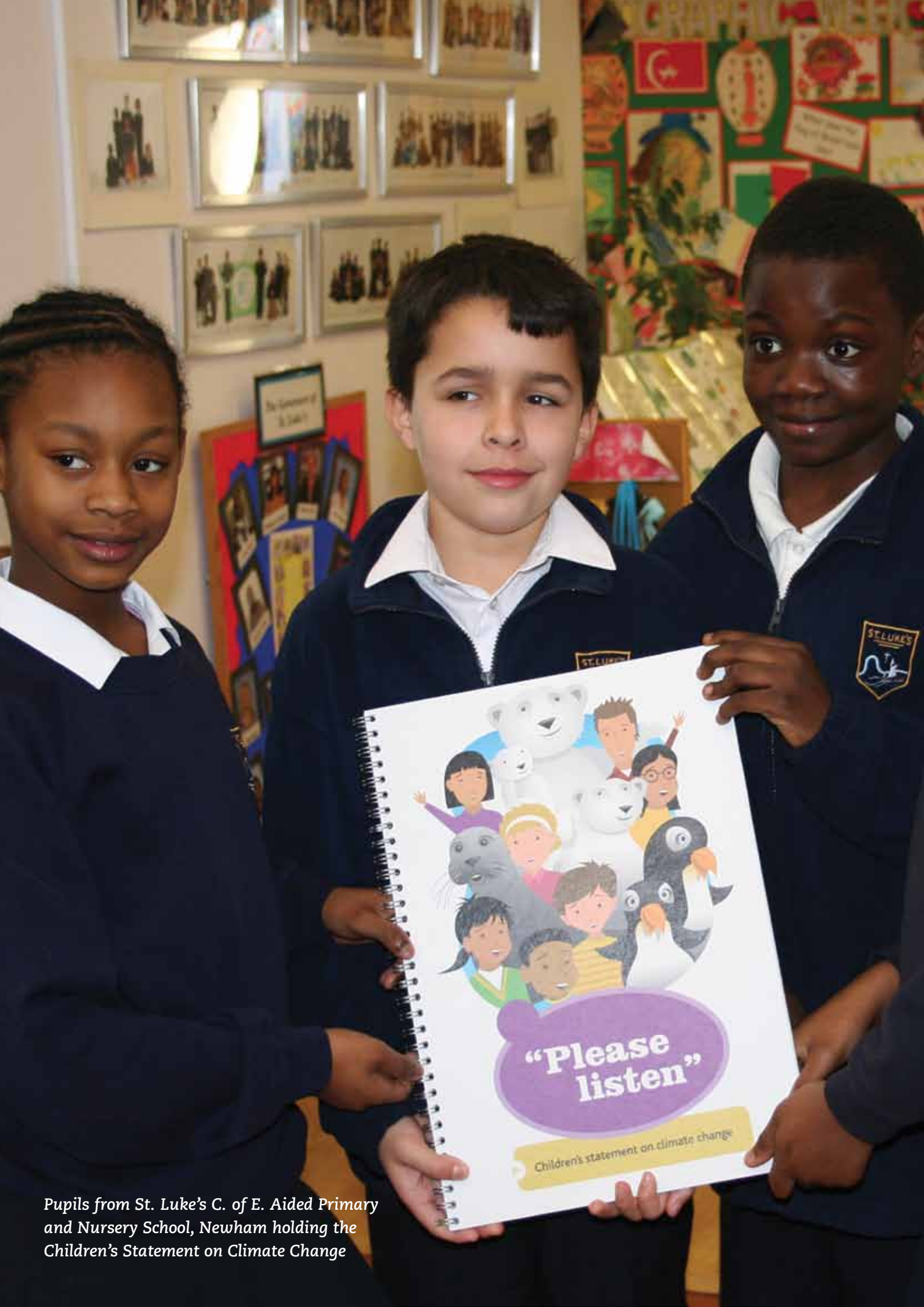
Pupils from St. Luke's C. of E. Aided Primary and Nursery School, Newham holding the Children's Statement on Climate Change