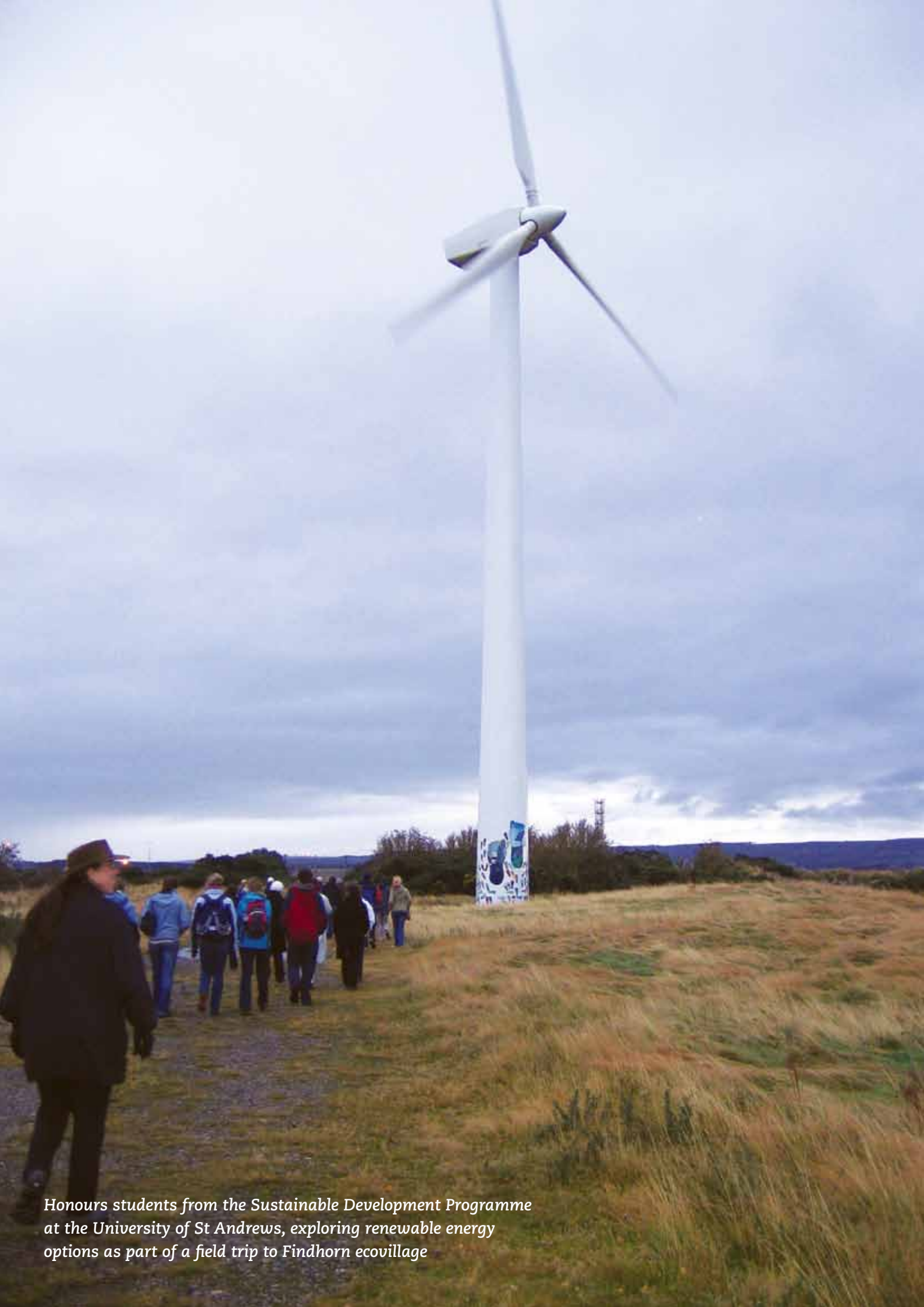
Honours students from the Sustainable Development Programme at the University of St Andrews, exploring renewable energy options as part of a field trip to Findhorn ecovillage