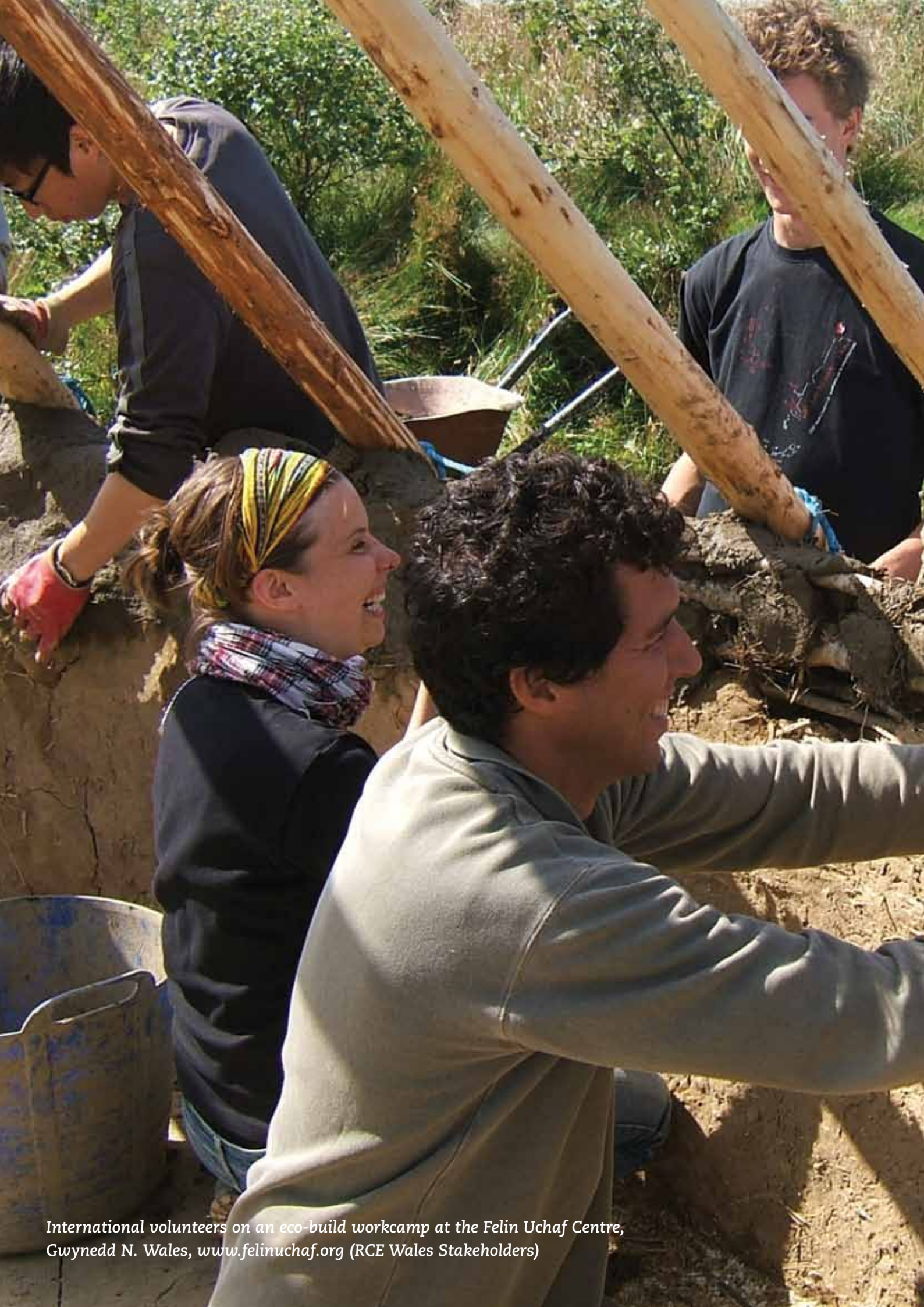
International volunteers on an eco-build workcamp at the Felin Uchaf Centre, Gwynedd N. Wales, www.felinuchaf.org (RCE Wales Stakeholders)