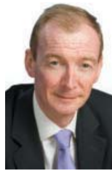
Pat McFadden BIS Minister for Business, Innovation and Skills