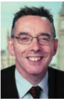
David Kidney DECC Parliamentary Under Secretary of State

We want to hear your views on potential action across our education and training system and how Government, business, individuals and training providers can work together to deliver the right skills to nurture sustainable growth and build Britain's low carbon future.