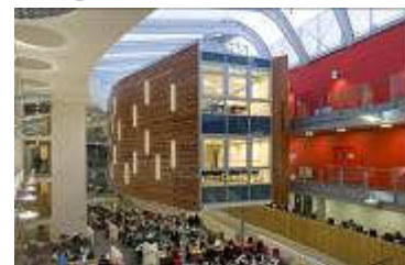
Inside Queen Margaret University showing open learning environment

www.eauc.org.uk/eauc-scotland-campus-sustainability-conference1